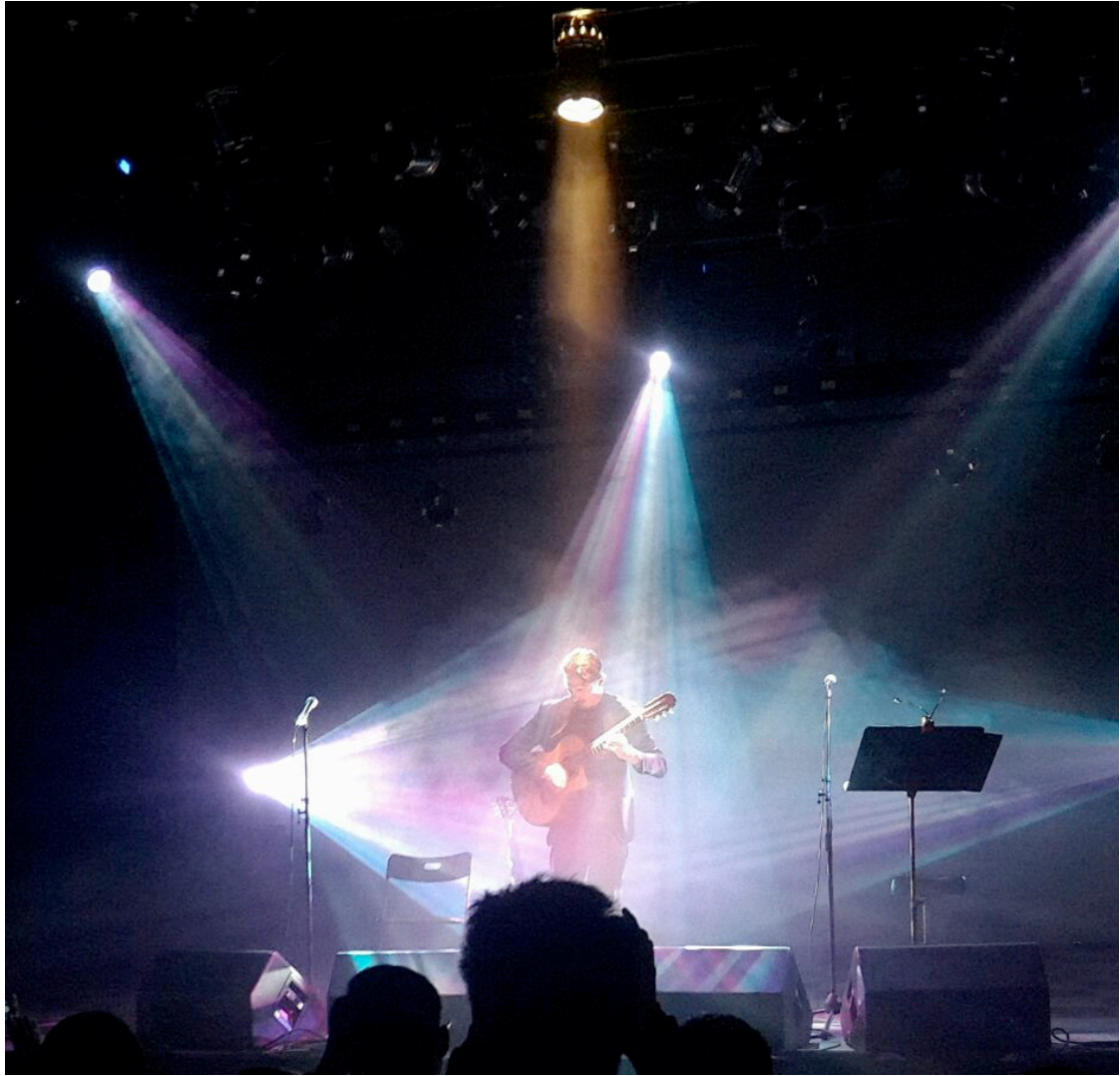
Cultural Centre ( Shanghai ) 2015